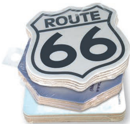
SHRINK WRAPPED IN SETS OF 4